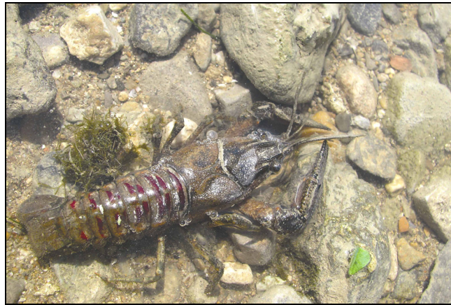
Figure 1. Orconectes limosus , captured in Baziaș (SW Romania) on the 3 rd May 2008.